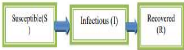
Fig. 1. SIR Model

To assess the risk of the pandemic AI/ML models play a significant role. To forecast the duration of the disease DL based models are used [23]. For disease transmission and prediction also DL based models are used. If risk assessment can be done early then the mortality of COVID-19 patients can be reduced.